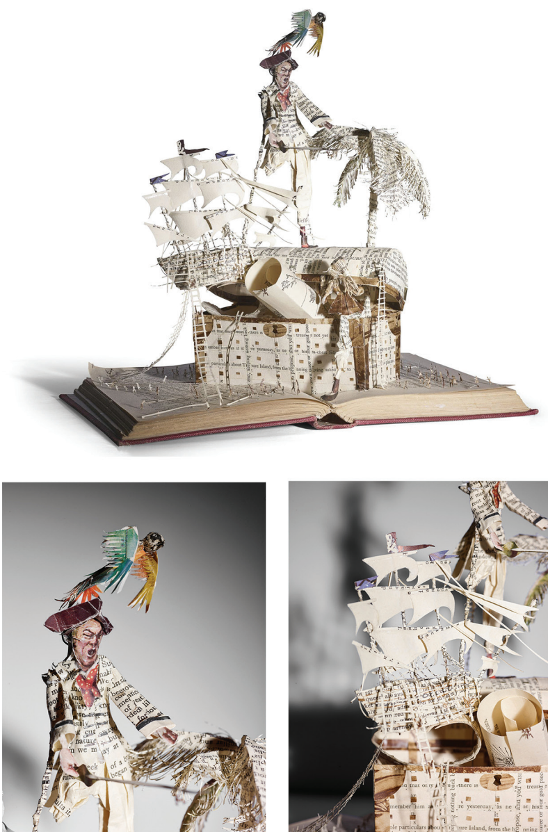
Treasure Island sculpture (2012) by unknown artist

Sculpture made from the book pages of Treasure Island by R.L. Stevenson (28 x 29 cm)