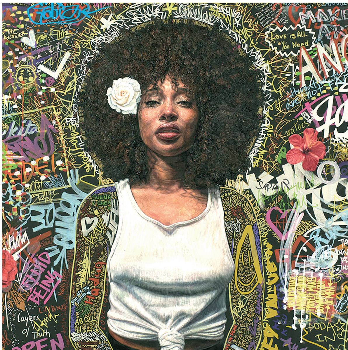
To Tell the Truth (2018) by Tim Okamura

oil paint, acrylic, spray paint and pen on canvas (239 x 234 cm)