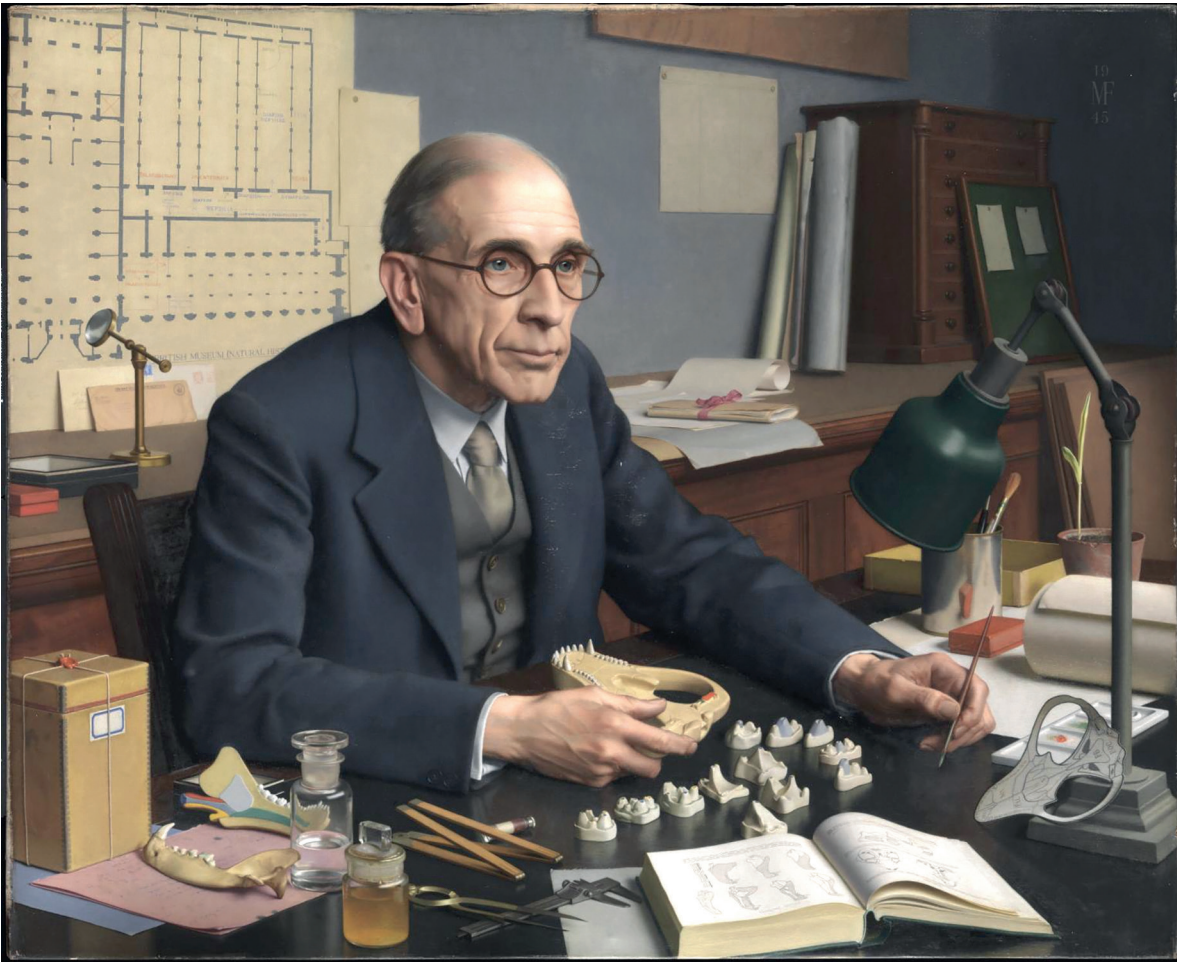
Sir Clive Forster-Cooper (1945) by Meredith Frampton oil paint on canvas (108 x 126 cm)

3. Comment on this painting, referring to: