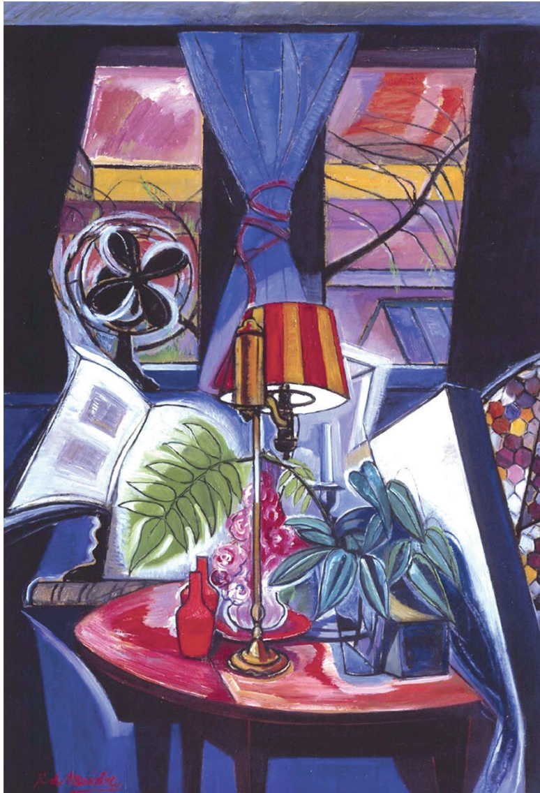
Interior with Lamp (1953) by Roy De Maistre oil paint on board (91 x 64 cm)

4. Comment on this painting, referring to: