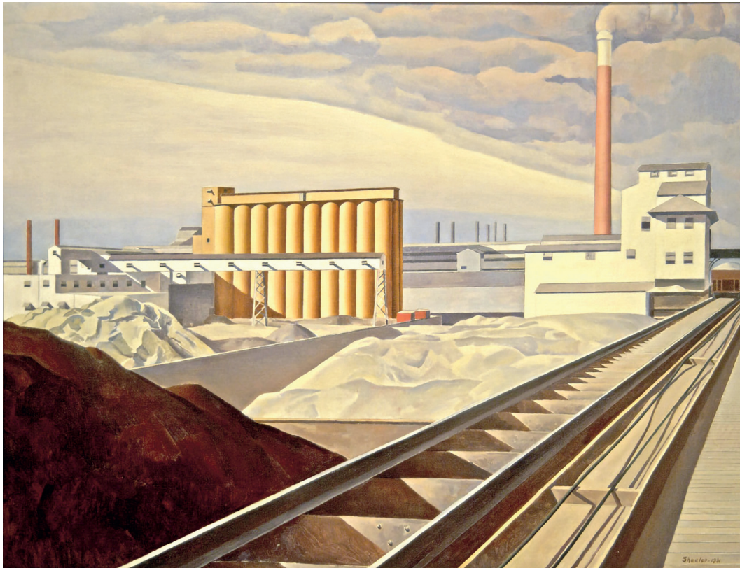
Classic Landscape (1931) by Charles Sheeler oil paint on canvas (64 x 82 cm)

5. Comment on this painting, referring to: