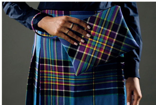
Team Scotland Commonwealth Games opening parade outfits (2022)