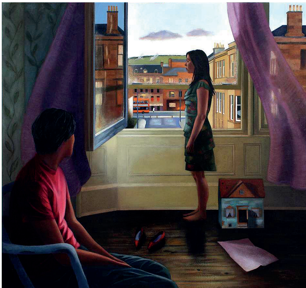
The Doll's House (2007) by Lesley Banks