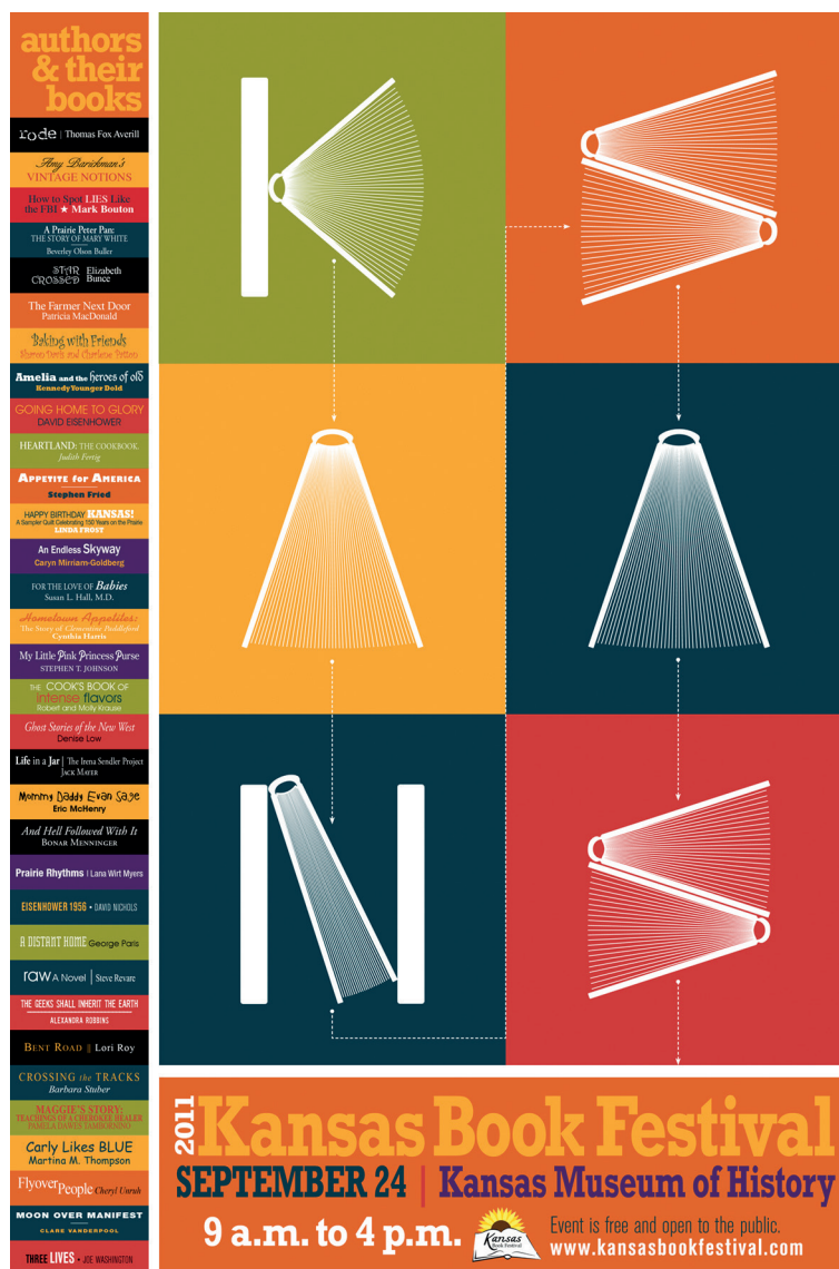
Kansas Book Festival poster design (2011) by an unknown designer

8. Comment on this poster design, referring to