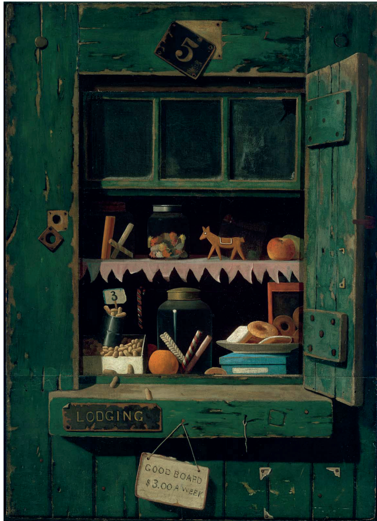
Still life (1885) by John Frederick Peto