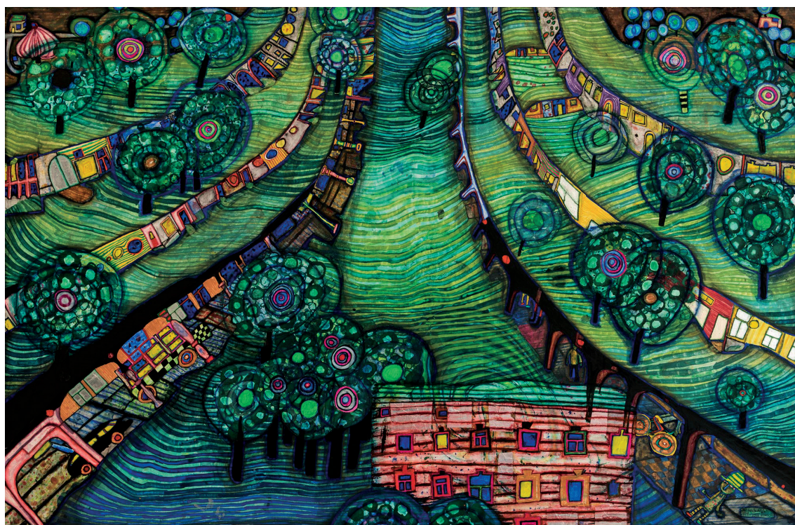
Green Town (1973–1978) by Friedensreich Hundertwasser Watercolour and oil paint on paper (97 x 145 cm)

6. Comment on this painting, referring to