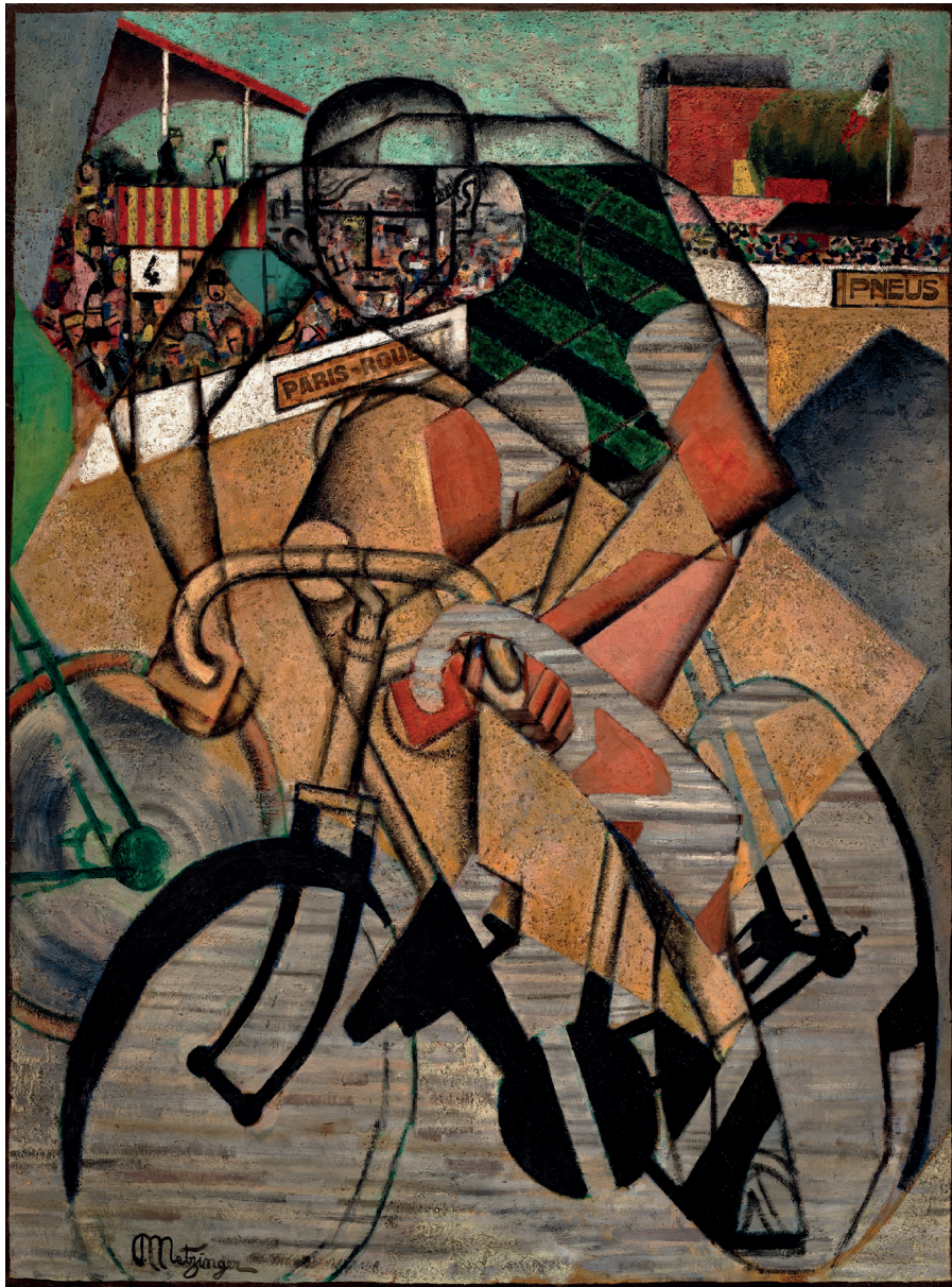
At the Cycle-Race Track (1912) by Jean Metzinger Oil paint and collage on canvas (130 x 97 cm)

4. Comment on this artwork, referring to