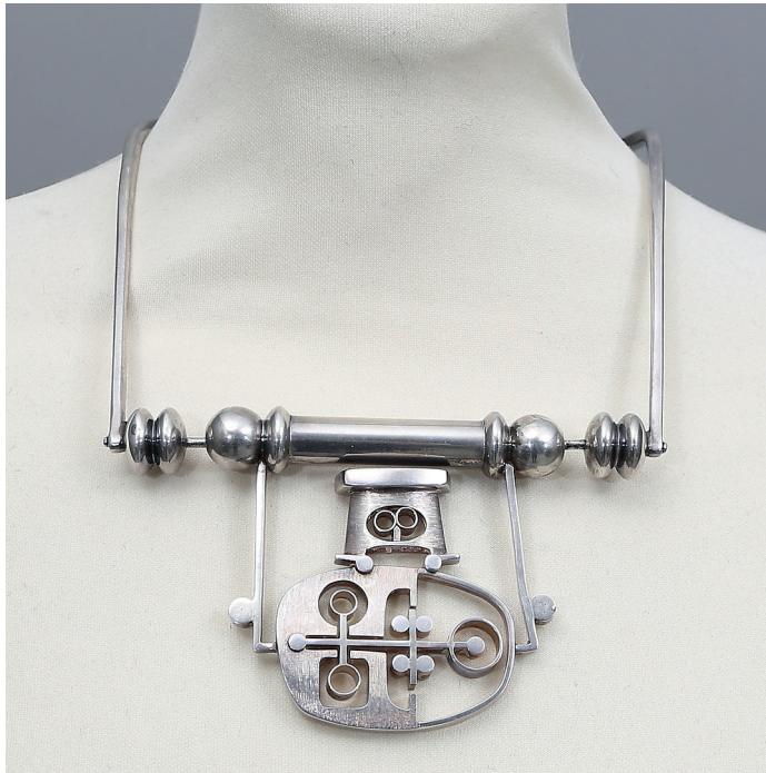
Necklace (1969) by Claës Gierdda