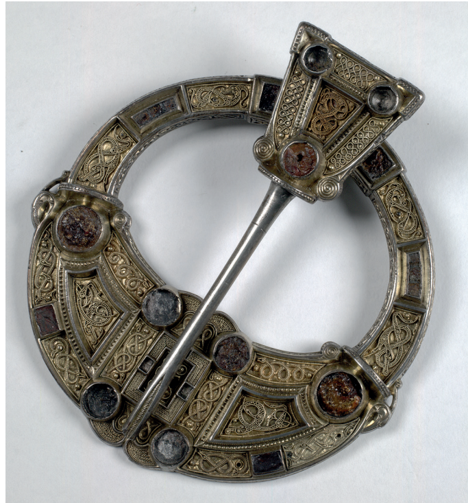
The Hunterston Brooch (c.700 AD) by an unknown designer materials: silver and gold with semi-precious stones (now missing)

11. Comment on this brooch design, referring to: