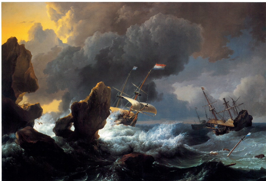
Ships in Distress off a Rocky Coast (1667) by Ludolf Backhuysen oil paint on canvas (114 × 167 cm)

6. Comment on this painting, referring to: