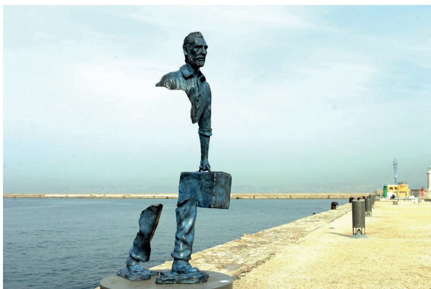
The Traveller (2013) by Bruno Catalano bronze – life size

4. Comment on this sculpture, referring to: