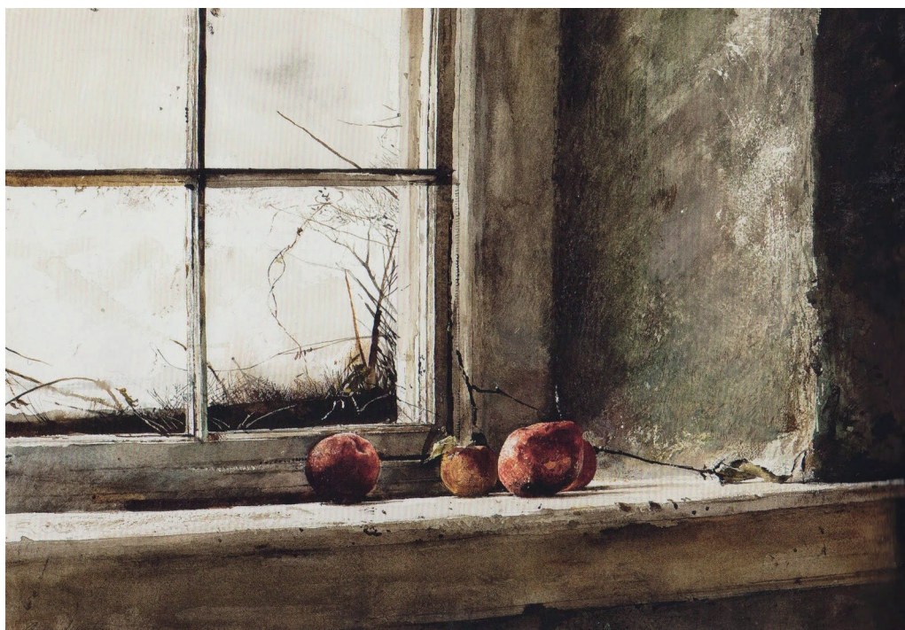
Frostbitten (1962) by Andrew Wyeth watercolour on paper (41 × 60 cm)

2. Comment on this painting, referring to: