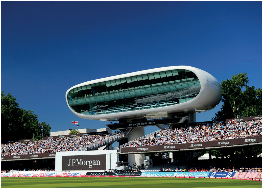
JP Morgan Media Centre (1999), Lord's Cricket Ground, designed by Future Systems materials: aluminium and glass

10. Comment on this design for a media centre, referring to: