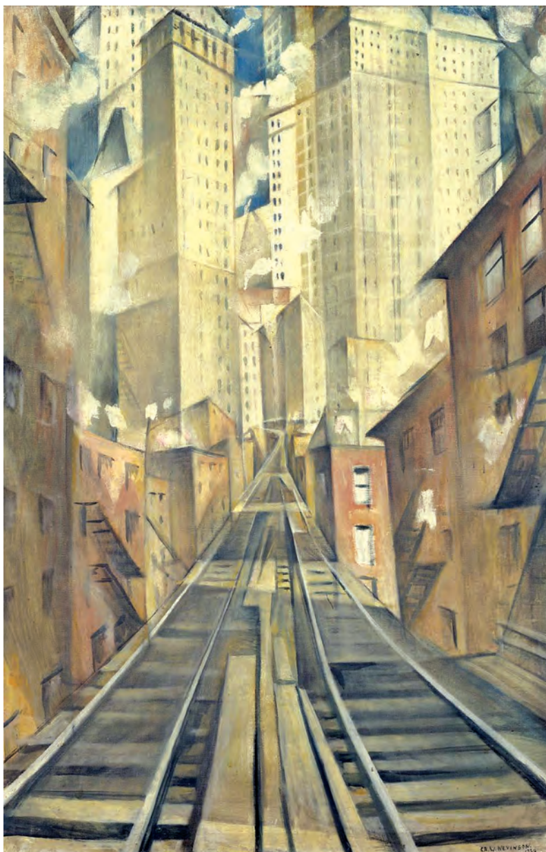
The Soul of the Soulless City (1920) by Christopher Wynne Nevinson oil paint on canvas (92 × 61 cm)

Read your selected question and the notes on the illustration carefully.