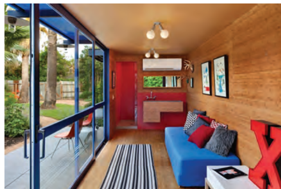
Guest House (2014) designed by Poteet Architects constructed using a recycled shipping container

10. Architects have to design buildings that are functional and have visual impact. Comment on this design for a guest house. In your answer, refer to: