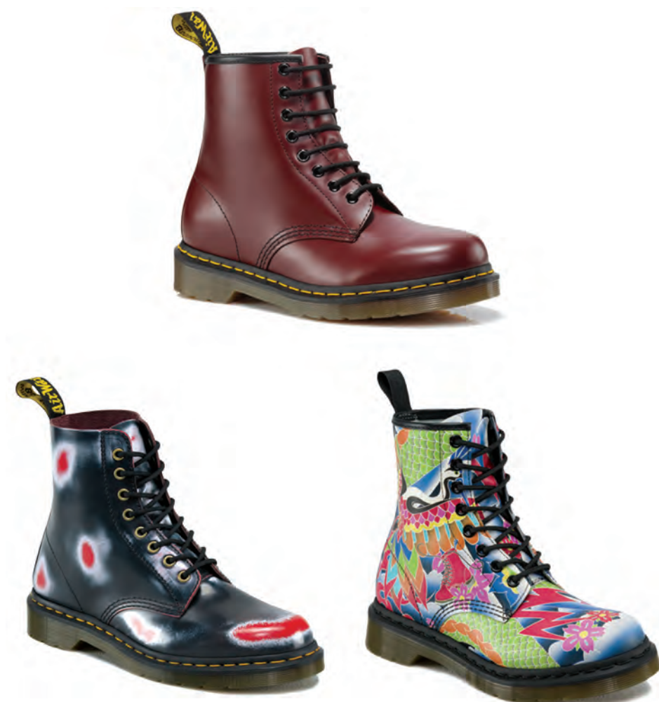
Dr Martens Boots (original boots designed in 1960, patterned boots designed in 2015), designers unknown materials: leather with plastic sole