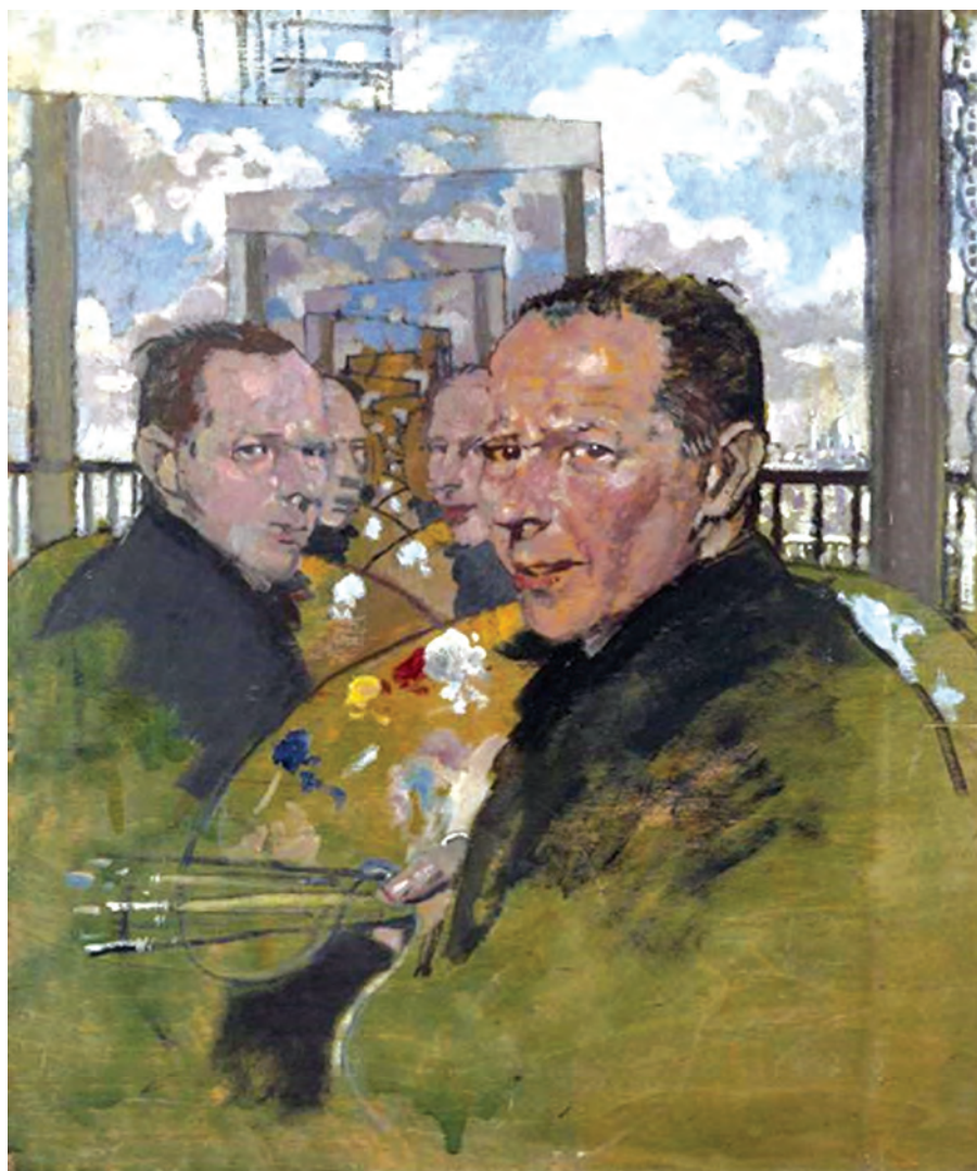
Self Portrait (circa 1924) by William Orpen oil paint on wood panel (79 × 65 cm)