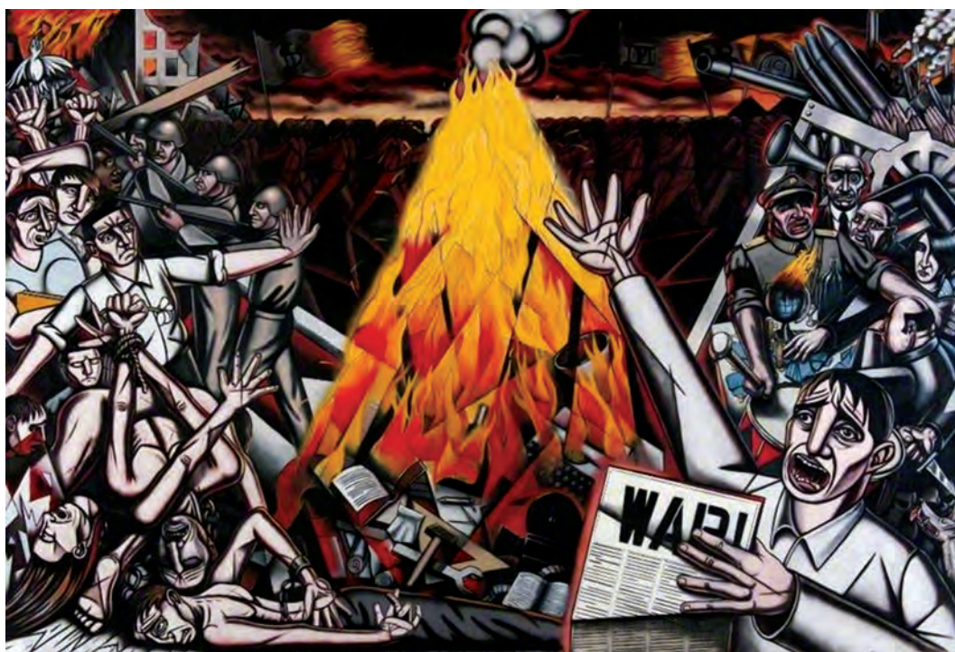
War (1983) by Ken Currie acrylic paint on canvas (213 × 320 cm)