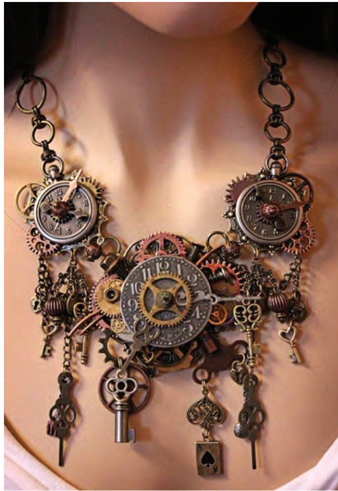
Necklace (2014) by Angela Venable

materials: old keys, watch chains and clock/watch parts