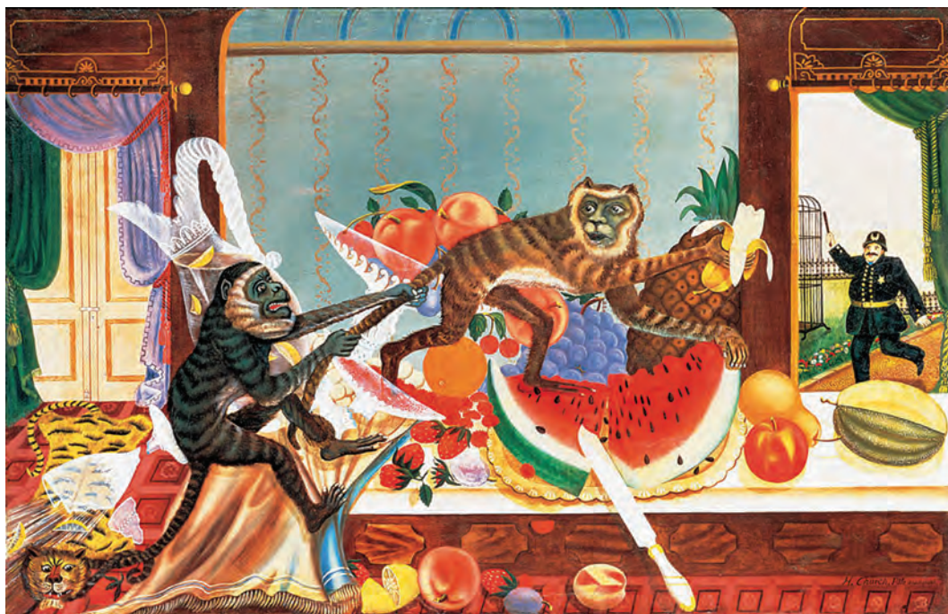
The Monkey Picture (1895–1900) by Henry Church oil paint on canvas (50 × 60 cm)