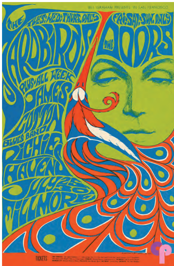
Poster for a musical concert (1967) designed by Bonnie MacLean lithograph 1 (54 × 35.5 cm)

Read your selected question and the notes on the illustration carefully.