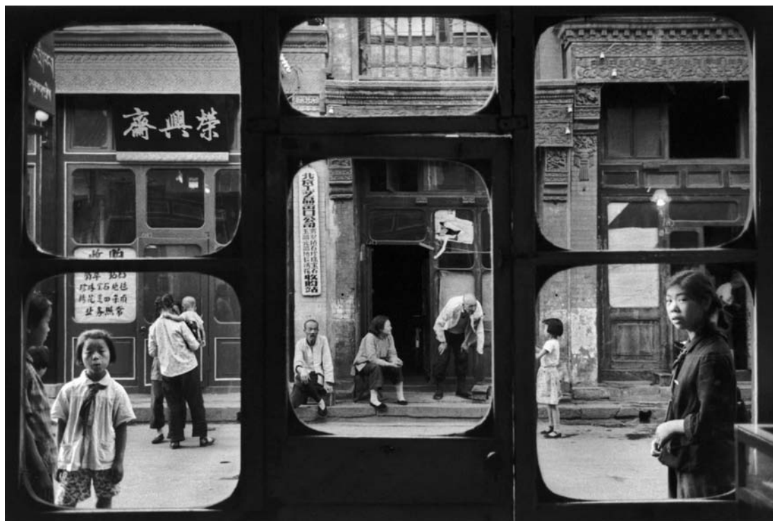
A Street in Beijing, as seen from inside a shop (1965) by Marc Riboud photograph

Read your selected question and the notes on the illustration carefully.