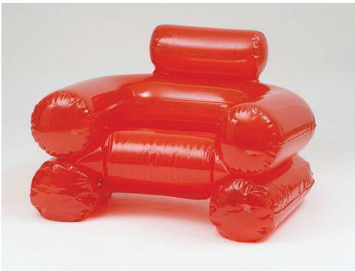
Blow Inflatable Armchair (1967) designed by Paolo Lomazzi, Donato D'Urbino and Jonathan De Pas

PVC plastic (inflated 84 x 120 x 103 cm)