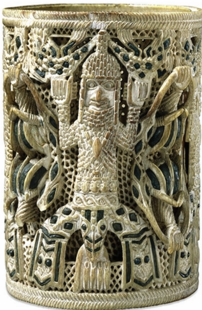
Armlet from Nigeria (15th-16th century AD)

ivory (natural material from elephant tusks) inlaid with coral beads