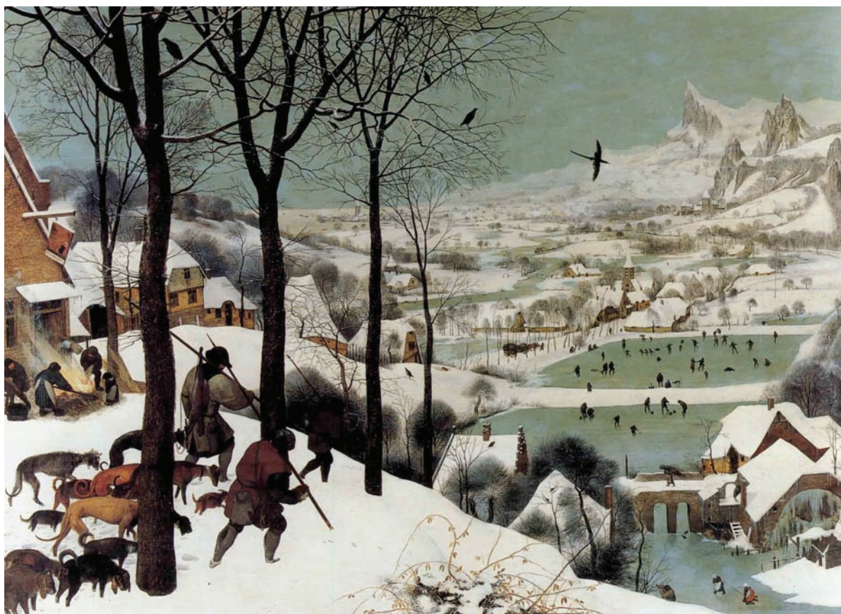
The Hunters in the Snow (1565) by Pieter Bruegel the Elder oil on board (117 x 162 cm)

3. Artists often respond to their surroundings. Comment on how the artist has represented this scene. In your answer, refer to: