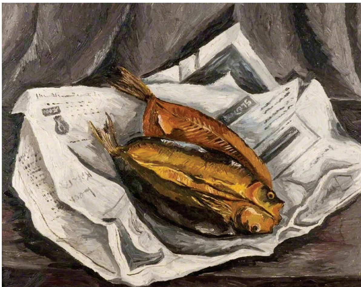
Kippers on a Newspaper (date unknown) by Valerie Weddup oil on board (57 x 75 cm)