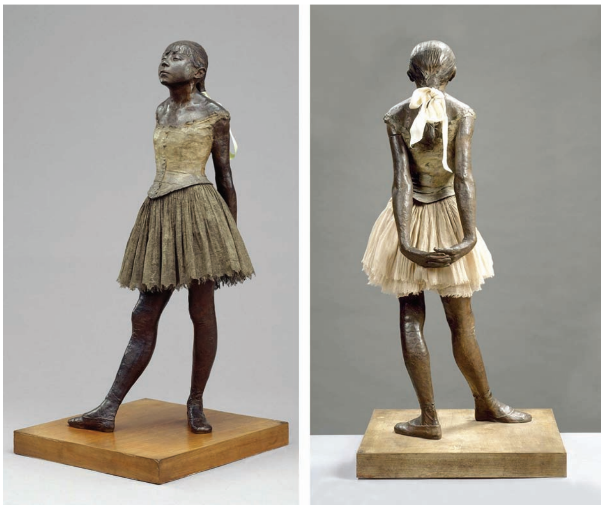
Little Dancer Aged Fourteen (1880 — 81) by Edgar Degas painted bronze with muslin and silk on a wooden base (98 x 42 x 37 cm)