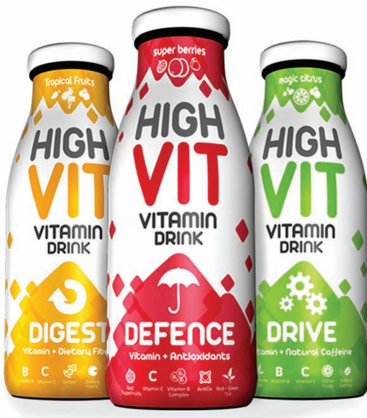
HIGH VIT Juice Drink Bottle (2012) designed by Moon Troops Creative Agency

Read your selected question and the notes on the illustration carefully.