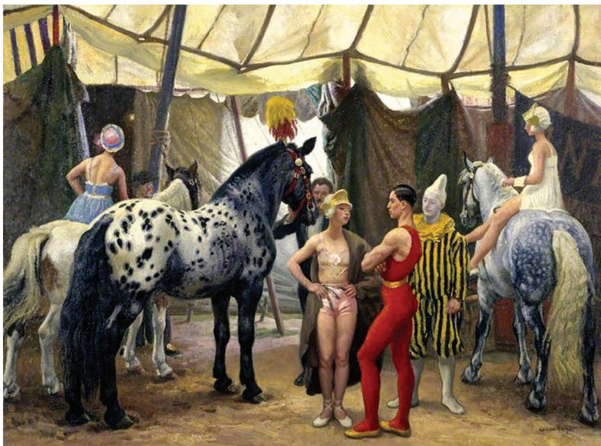
Circus Matinee (circa 1938) by Dame Laura Knight oil on canvas (84 x 114 cm)