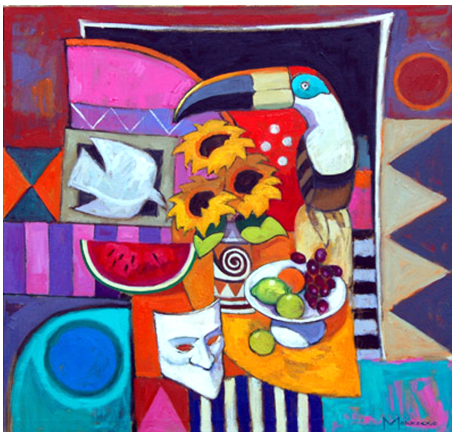
Toucan & Sunflowers (2007) by Jack Morrocco oil on canvas (86 x 91cm)