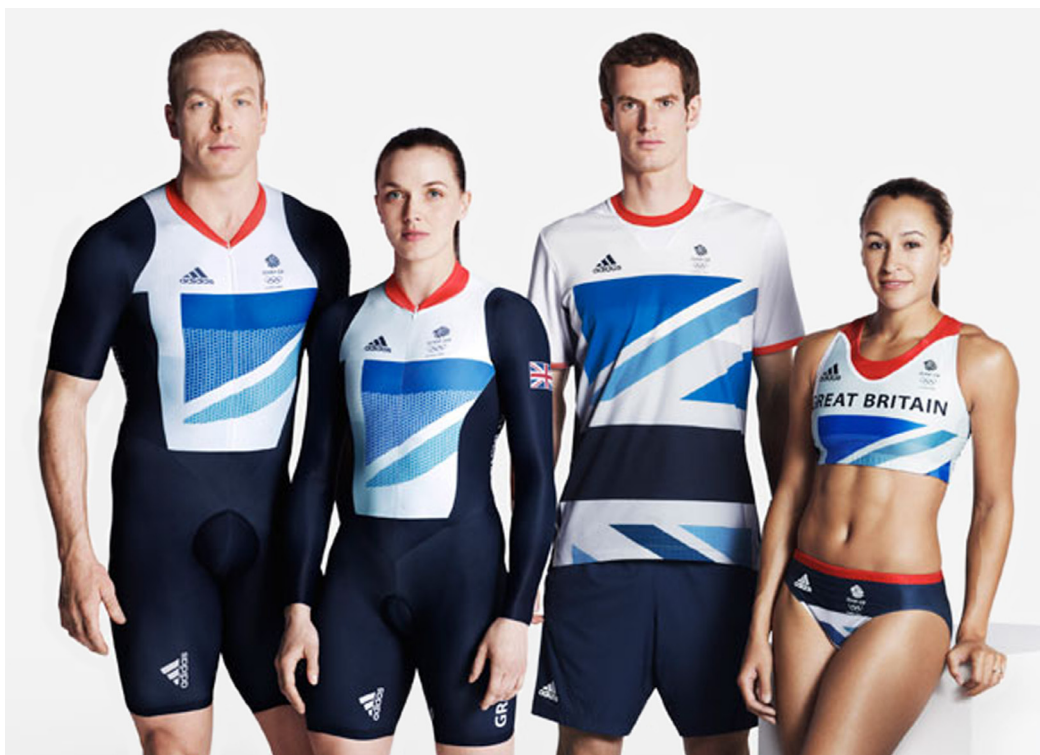
Adidas Team GB Olympic Kit (2012) designed by Stella McCartney

12. Style and function are important when designing sportswear. Comment on this range of designs. In your answer, refer to: