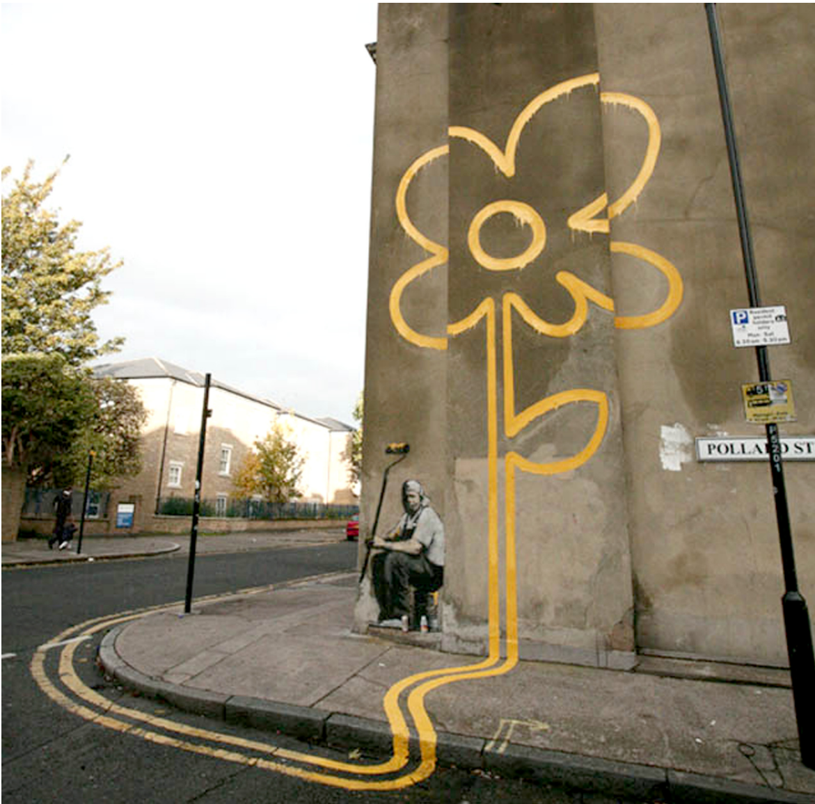
Yellow Line Flower (2007) by Banksy stencilling spray paint