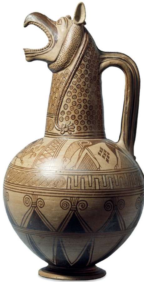
Jug with a griffin-head 1 spout (circa 675 BC – 650 BC) by unknown designer