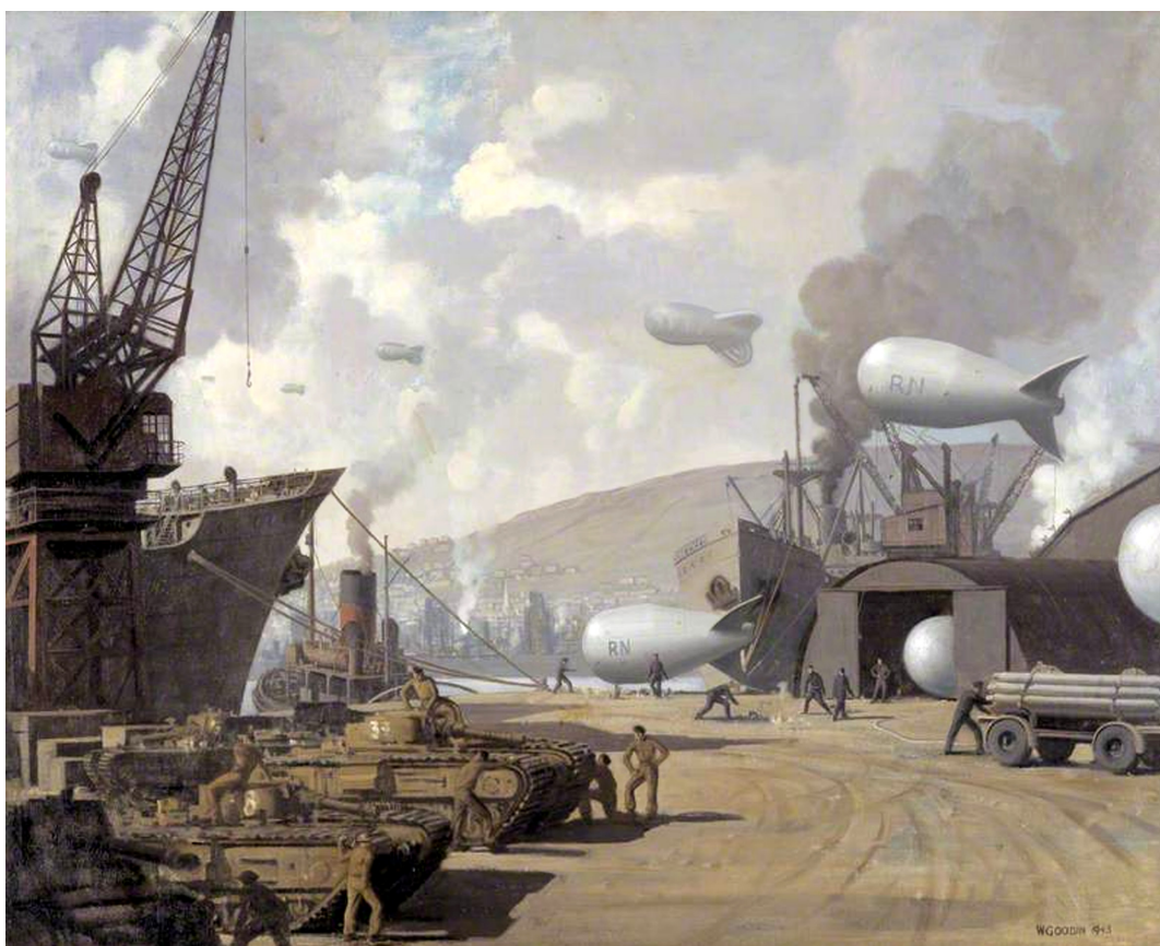
Swansea Docks in Wartime (circa 1940) by Walter Goodin oil on canvas (74 x 92 cm)