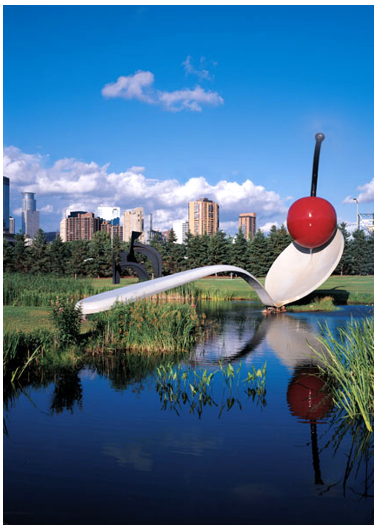
Spoonbridge and Cherry - Minneapolis Sculpture Garden, Walker Art Centre, Minneapolis (1988) by Claes Oldenburg and Coosje van Bruggen stainless steel and aluminium painted with polyurethane enamel (9 x 16 x 4 m)